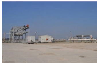
North of Plot

All utilities: water (raw, demineralised and potable) compressed air and effluent handling are available from the Wilton International site.